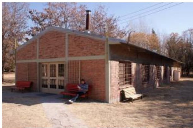
The kitchen area from outside