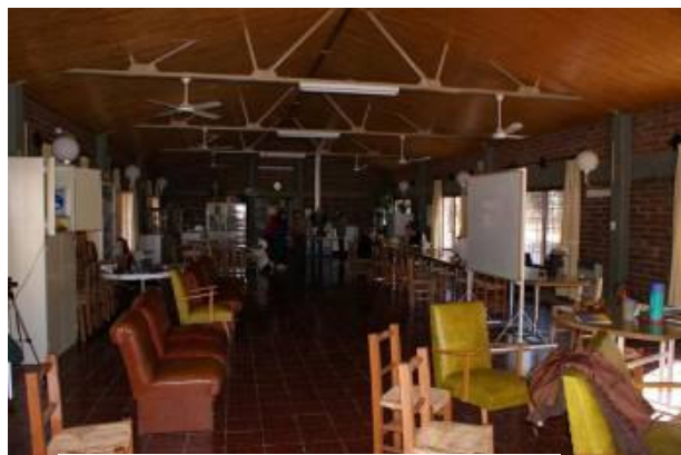
The kitchen area inside

HPB LODGE OF THE THEOSOPHICAL SOCIETY, INC.