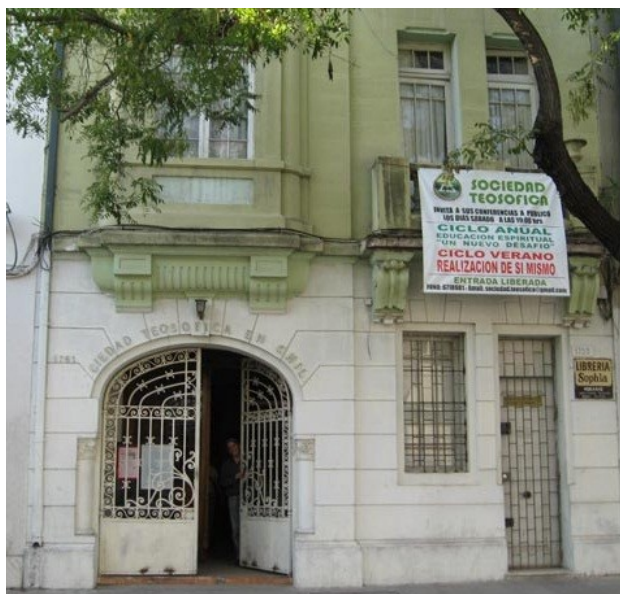
The TS Headquarters building in Santiago, Chile