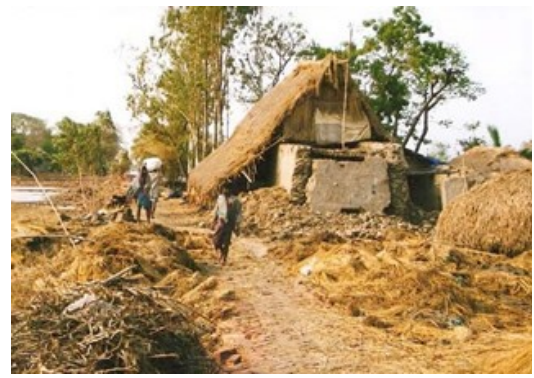
The local TOS groups provided aid at the Aila Relief Camp, following devastating floods in the area