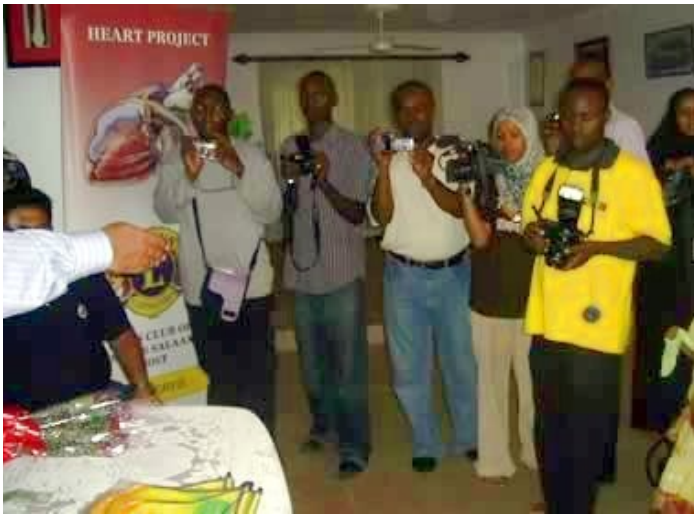
Journalists photographing the presentations and send-off party for the 'heart babies'.