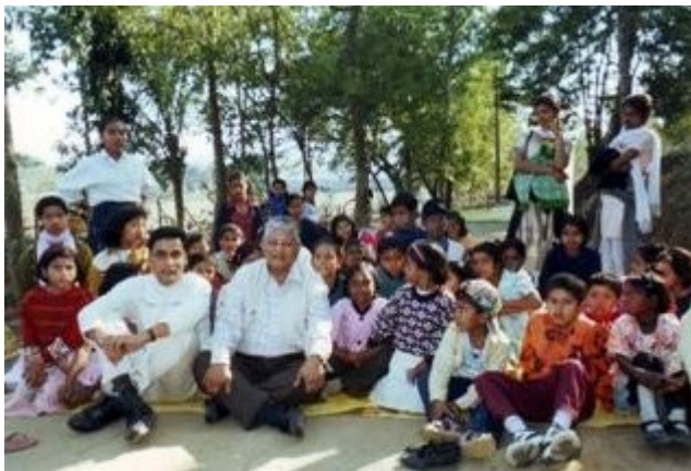
Two key TOS workers sit down to tell uplifting stories to the children of a TOS run school and a local orphanage