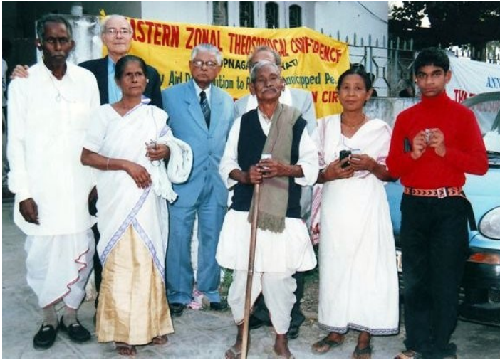
Hearing aid presentation