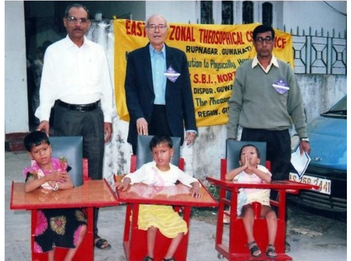
Wooden chairs made to measure for three handicapped children