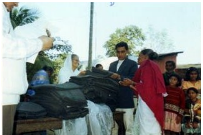
Blanket distribution after floods