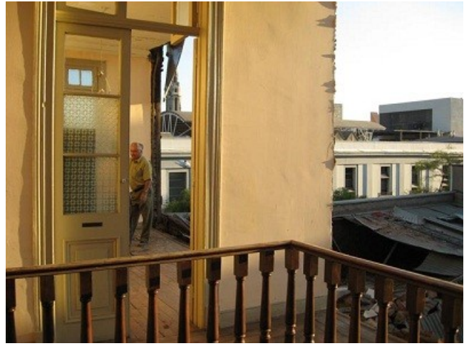
Areas of the TS building damaged in the earthquake